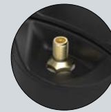
Compressed air plug