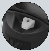
Safety valve with depressurisation option