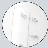
Protective sleeve for valve chamber