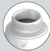
Large opening easy filling