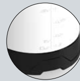
Base for greater stability