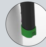
Ability to identify content via coloured caps