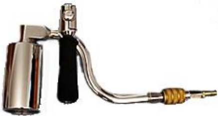
Short Arm Buffer - P/N BM01 Long Arm Buffer – P/N BM02

The Buffmaster Tools 'Long Arm Buffer' and 'Short Arm Buffer' represent the most efficient way of compounding aircraft leading edges by far.