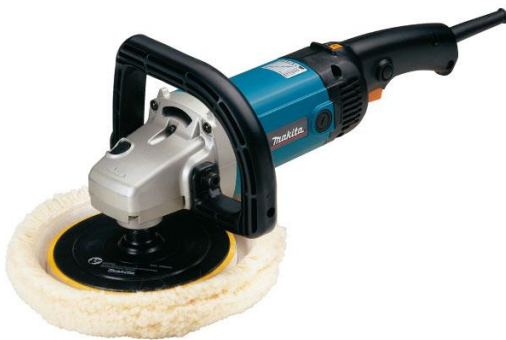
Makita 9227CB - P/N LDP01 Silverline – P/N BFP016

-- Purchase a "Velcro" mount buffing head for the above buffer/polisher if it does not come with Velcro-type backing pad.